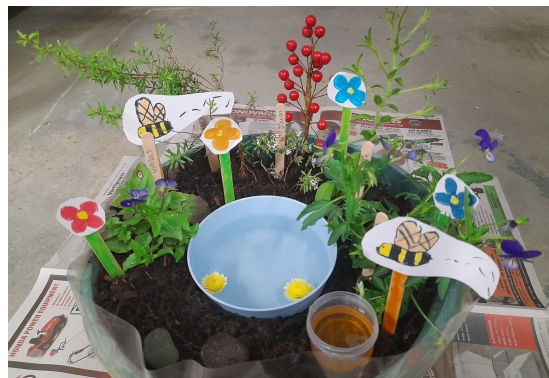
Emily's Bee Garden