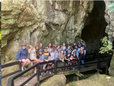
Kawiti Glow Worm Caves