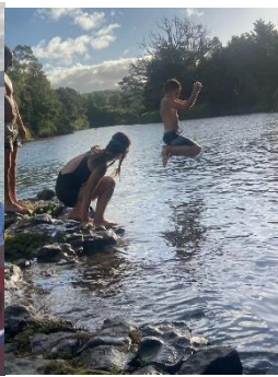
Bombing into the river