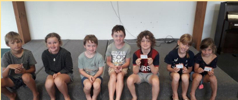
Figure 1 Last weeks winners

Can't wait to see the finished video. The video will be available for schools around the country to watch in about a month's time. As always I was very proud of how our Whangarei Heads School children acted and responded on the day. Ka pai to mahi, great work guys!