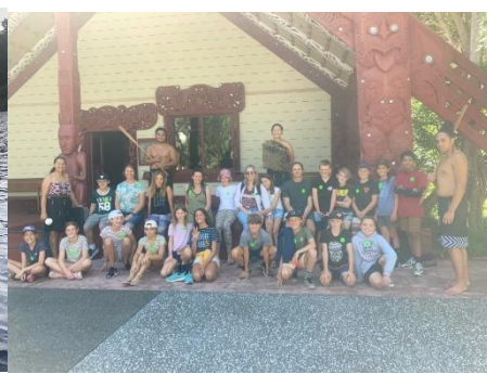
Cultural Experience at the Treaty Grounds