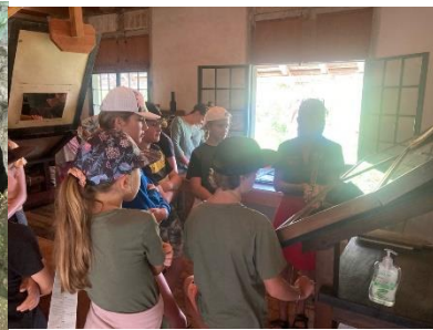
Pompallier Mission Printery