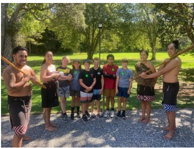
Inspiring Cultural Experience