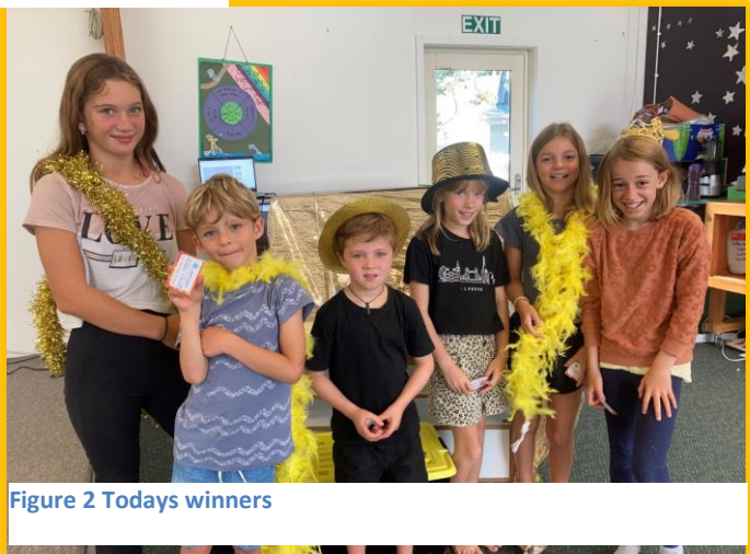
Figure 2 Todays winners